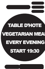
TABLE D'HÔTE VEGETARIAN MEAL EVERY EVENING START 19:30